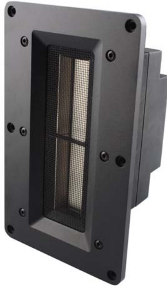
NeoPro5i True Ribbon Tweeter